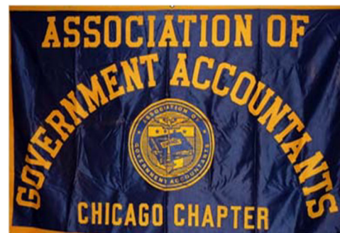
Chicago Chapter flag