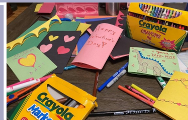
Hand made Valentine's Day cards for senior citizen's in the local care facility.