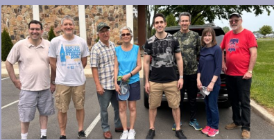
Members participated in program to honor veterans by assisting in the placement of flags on Veteran's grave sites

In October 2022, members ran/walked for Homefront, raising $201 for the charity