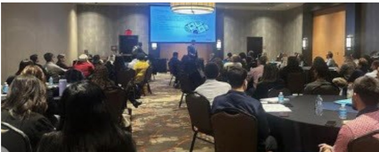
The 2024 NM and Albuquerque Chapter PDT attendees