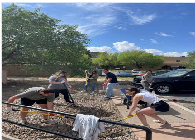
CEC members along with friends and family hard at work during a community service event benefiting Casa Esperanza.

Goal 5: Update and maintain the website and social media accounts in order to generate consistent messaging and com-