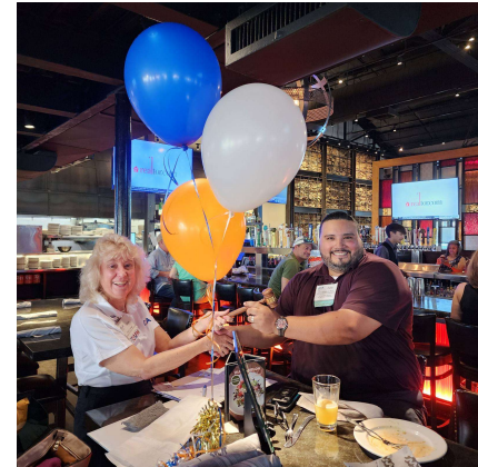
Passing of the Gavel at 8/13/24 Happy Hour

We are again meeting at the Alamo Area Council of Governments ( AACOG ) Building at 410 & Perrin Beitel in San Antonio, tentatively the second Thursday of the month through June 2025 .