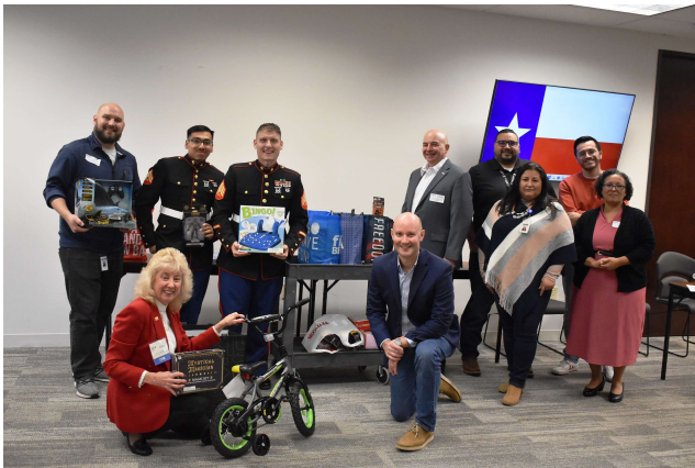
12/14/23 – Toys for Tots Collection at Artificial Intelligence Training

At the beginning of the 2023-2024 year, we began our post-COVID revitalization effort! After several Zoom sessions with AGA National personnel, an August 2023 Happy Hour at Stone Werks Big Rock Grille, and input from a combination of seasoned and new members, we hosted ten lunch/training meetings , with an average of 9 in-person attendees and 26 virtual attendees throughout 12 states!