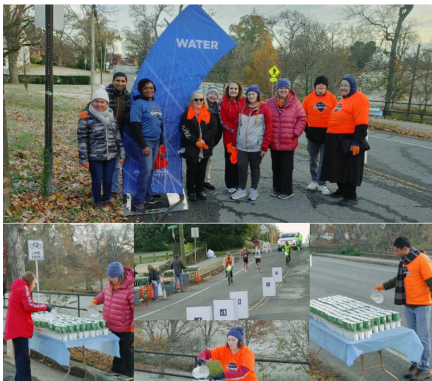
Pictured Above: Nov 2021 – Nashville AGA volunteers at the Rock ‘N’ Roll Marathon