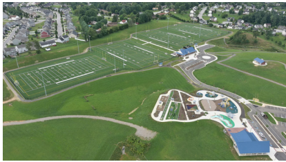
Christiansburg Huckleberry Park FY 2022-2023

An approx. 50-acre park off Peppers Ferry Road with four full-sized rectangular fields, two picnic pavilions, a splash pad, a small and large dog