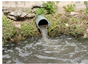
Christiansburg Industrial Park Stream Restoration and SWM Improvements Duration: Spring 2024-Fall 2024

this project is to reroute drainage that currently flows under existing buildings on Main St. while also relocating water and sewer lines on Hickok St.