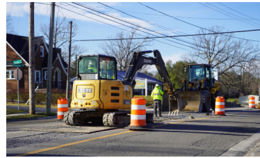
Waterline Replacement FY 2022-2023

park, an inclusive playground, an adult fitness zone, a challenge course, nearly two miles of trails, and green space for passive recreation.