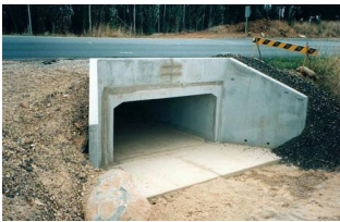
Hickok Street Storm Drainage Improvements Duration: Spring 2024-Fall 2025

Crews will construct a new box culvert on Hickok St. NW between First St. and Commerce St. NW. The ultimate goal of